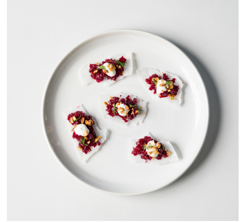
Beetroot, dill & whipped feta