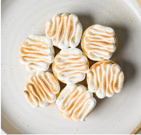
Lemon Meringue tart