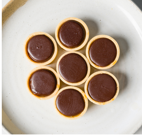
Salted caramel and chocolate tart