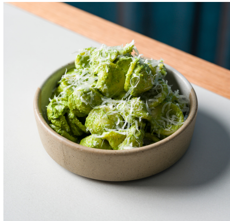
Orechhietee, pesto and basil