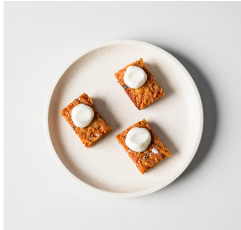
Fried potato, whipped cod roe and chive