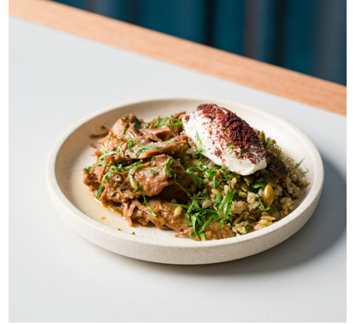
Braised lamb, labneh and grain