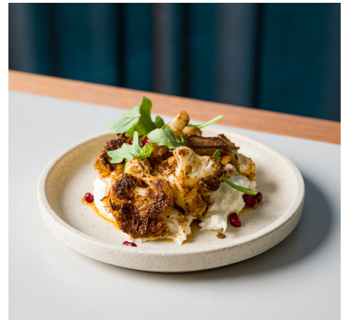
Roast cauliflower, smoked yogurt and pomegranate