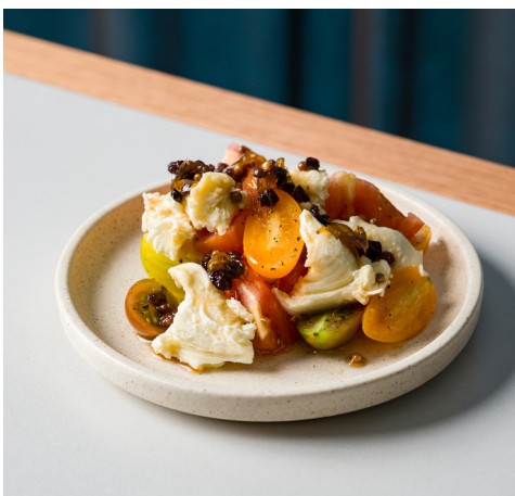
Heirloom tomato, agro dolce and fior de latte