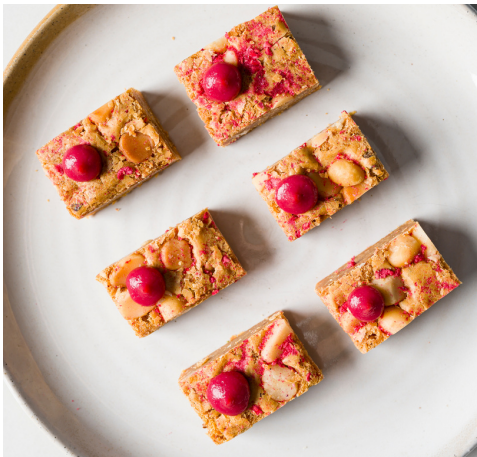
Raspberry and macadamia blondie