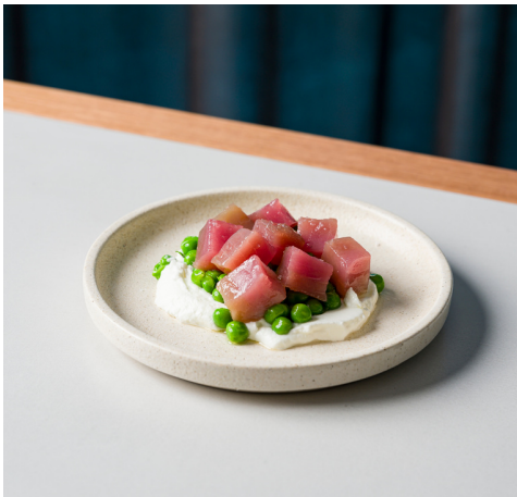
Tuna, peas and curd