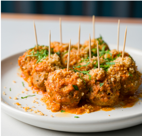
Pork and fennel meatballs, cheddar crumb