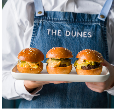
Mini Dunes burger