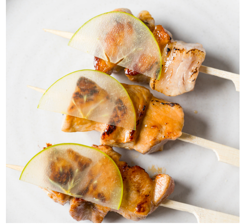
Grilled pork skewers and apple