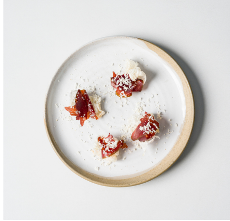
Bresola and Horseradish