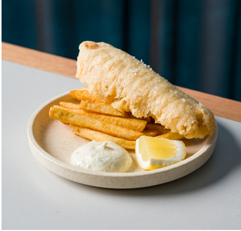
Semolina battered market fish