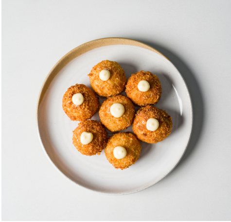
Four cheese arancini