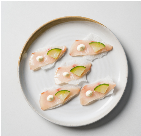
Kingfish, creme fraiche and cucumber