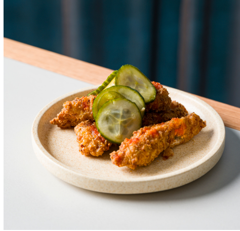
Southern fried chicken and cucumber pickles