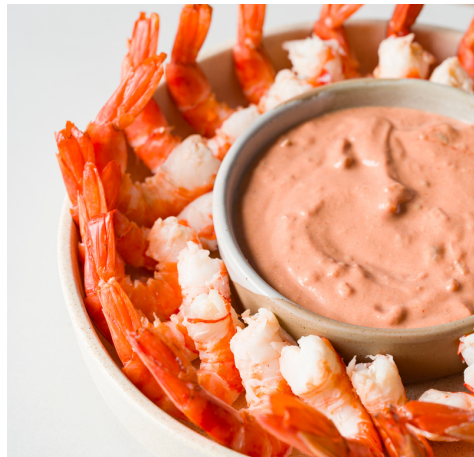
Cooked QLD Tiger Prawns, bloody Mary sauce