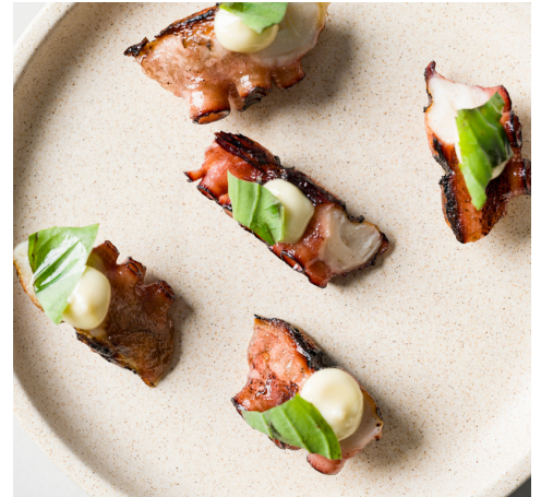
Octopus, basil and aioli