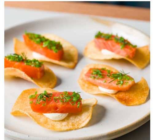
Smoked Ocean trout chive and dill